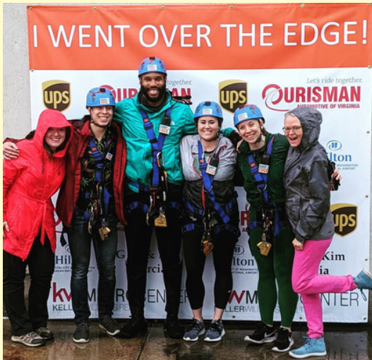
The District Church Team

You may have heard that we did something a little different for our spring fundraiser this year. On May 6th, we took over the Hilton Crystal City and had over 80 friends and supporters rappel down the side! The rain slowed us down a little, but did not stop the fun. From 9 am to 5 pm, we cheered everyone on from our ground-level festival in "The Landing Zone" as each person descended 160 feet. It was a fantastic day and raised over $230,000!