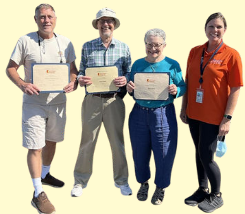
St. Katherine Greek Orthodox & Metropolitan DC