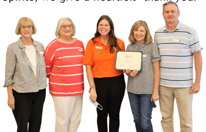
Providence Presbyterian Church